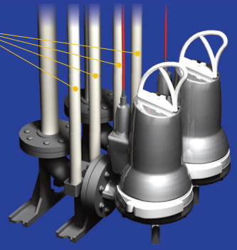
Twin pumps with guide rails